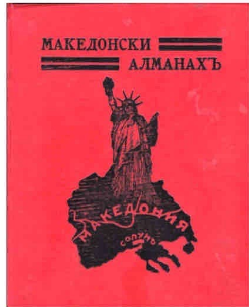
Red Book Cover