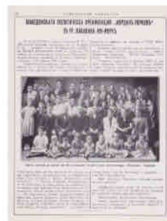
Book from the Red Book